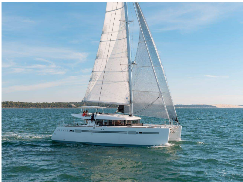
Lagoon 450 S - September 2018 - Mention obligatoirement à bord: Photo Nicolas Carré