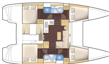
version premium 4 cabins / 4 cabin premium version